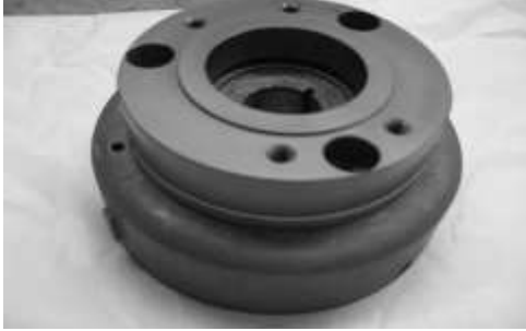
Green spacer, shim plate and fly wheel (Picture 3)

A small piece of the cooling fan cover must be removed to install your starter kit. A file, sander or grinder can make quick work of this task. Remove just a SMALL part of the INLET LIP as shown below.