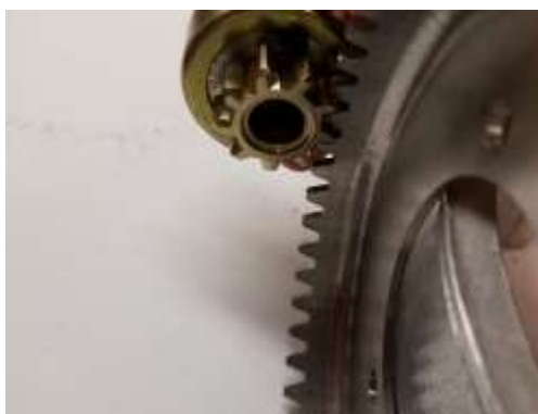
FIGURE 5 (2 OF 2)

**GPL HEAVY DUTY STARTER LIMITED NINE MONTH WARRANTY** If warranty security tag is removed from starter then warranty is void.