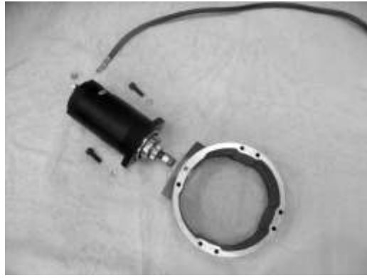
FIGURE # 2