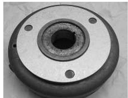
Shim plate on flywheel (Picture 2)