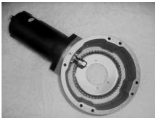
FIGURE 5 (1 OF 2)